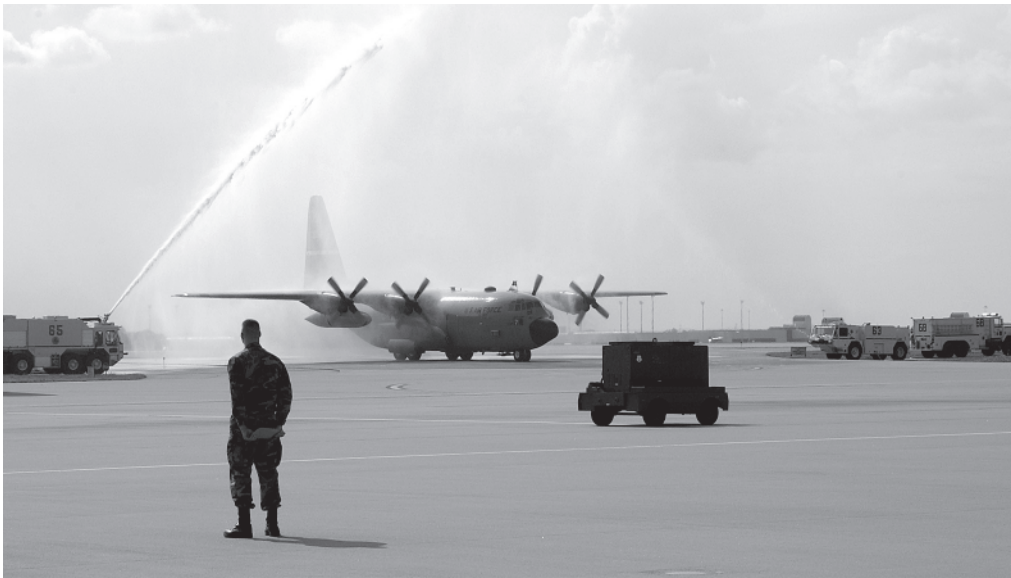
LEFT: Each of the five returning Kentucky Air Guard C-130s were welcomed with a drenching spray from the base fire trucks.